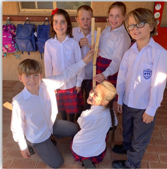
Year 4 Measuring Activity

Our Father who art in Heaven. Hallowed be thy name. Thy kingdom come, thy will be done, on earth as it is in Heaven. Give us this day our daily bread and forgive us our trespasses, as we forgive those who trespass against us. Lead us not into temptation but deliver us from evil. Amen.