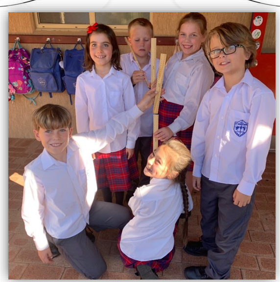
Year 4 Measuring Activity