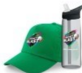
MASTER BLASTERS KIT