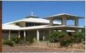
ST THOMAS MORE, MARGARET RIVER