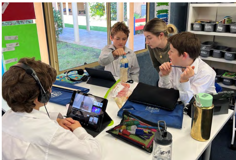
Year 4 students learning about Friction.