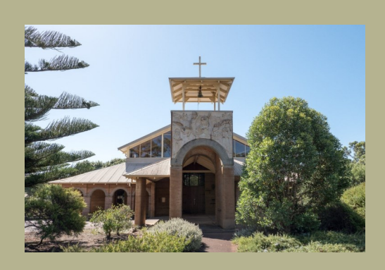
Please like the St Thomas More Catholic Parish's Facebook page.